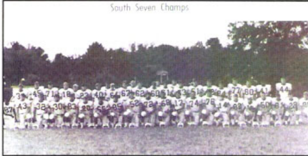
The 1968 Undefeated Football Team yearbook picture.

The 1968 Undefeated Football team held a reunion on Friday, October 3, and Saturday, October 4, 2008. Some of the reunion activities on Friday included a guided tour of the new high school, a catered picnic from 17th Street Bar & Grill, and reserved seating for the players to enjoy the Carbondale versus Mt. Vernon football game. At halftime of the Terrier football game, the players, coaches,